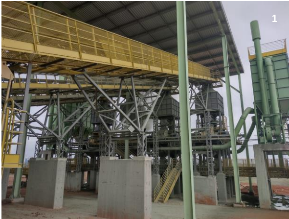
1 – Eight mills installed.