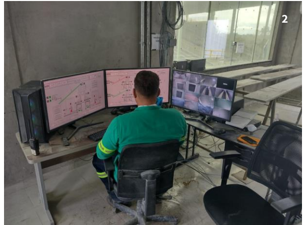
2 – Control room.

The installation of the last 4 mills was completed (out of a total of 8 mills), a grinding shed was built over the 8 mills, and the installation of 2 screen crushers was completed to improve mills efficiency. 1 new road scale was installed at Plant 2.