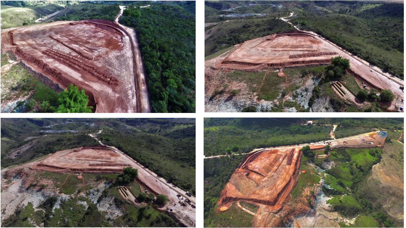
* Earthwork process in the construction area of Plant 2.

Verde will use this newsletter to provide monthly updates about the construction development of Plant 2, which is expected to reach commercial production in the third quarter of 2022. Plant 2 will have an operational capacity of 1,200,000 tpy, raising Verde's overall production capacity to 1,800,000 tpy.