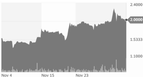
TSX: NPK Average Volume (3 months) = 67.22k

The graphs below show Verde's stock value over the past 30 days and average volume statistics over the past 3 months, as of December 01, 2021: